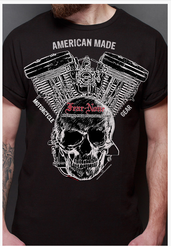
FEAR-NONE motorcycle clothing's Old School Collection

For media inquiries or to explore the "Classic American Skulls" collection, please contact: