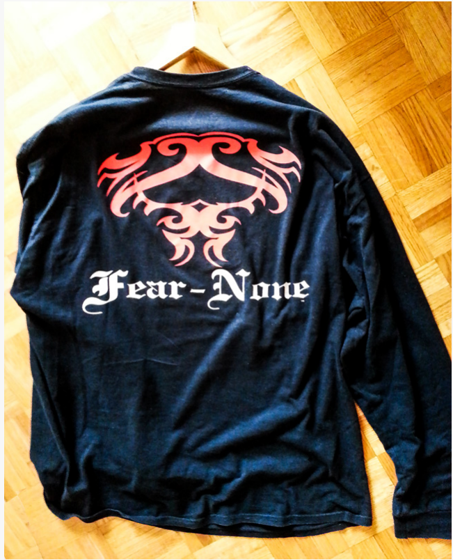
Fear-NONE Motorcycle Clothing Continues National Global Growth