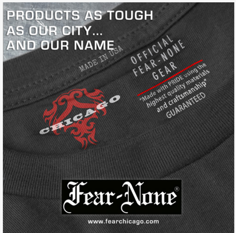
FEAR-NONE Gear Original Motorcycle Clothing