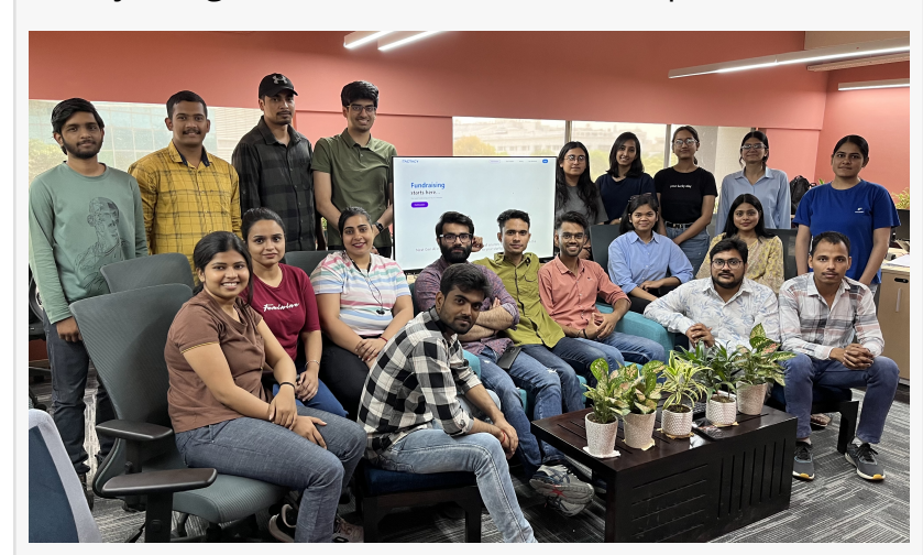
Team Factacy shares the excitement on the launch of startupinvestors.ai