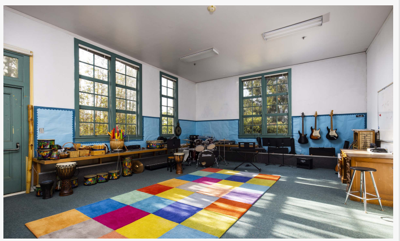
Potential uses for group residential, education, hospitality, corporate, & more

idyllic setting for a private Santa Barbara retreat, its unique communal qualities also give enterprising bidders a chance to develop their own ambitious dreams in fields as varied as hospitality or education. With its coveted location, amenities, and rich history, this property is the perfect purchase for a savvy investor."