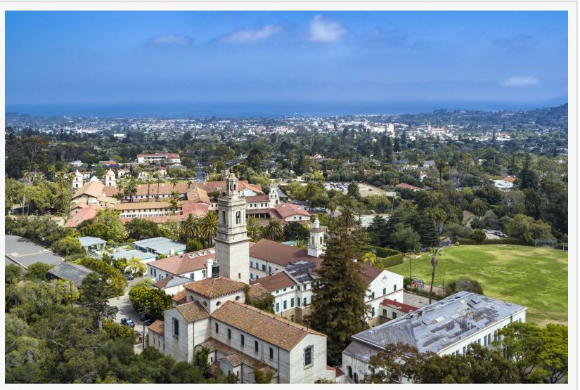
Formerly part of the Santa Barbara Mission and a designated historical landmark

Structures on the property include the over 40,308± square-foot Grand Main building, Gymnasium, Chapel and Bell Tower, Arts and Sciences Building, Workshop, and Library/Dining Hall all totaling close to ±130,000 square