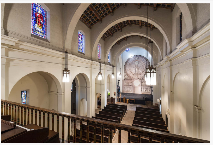
Adaptable property zoned for residential single units

"The flexibility of 2300 Garden sets it apart," said Di Prizito. "While it's an