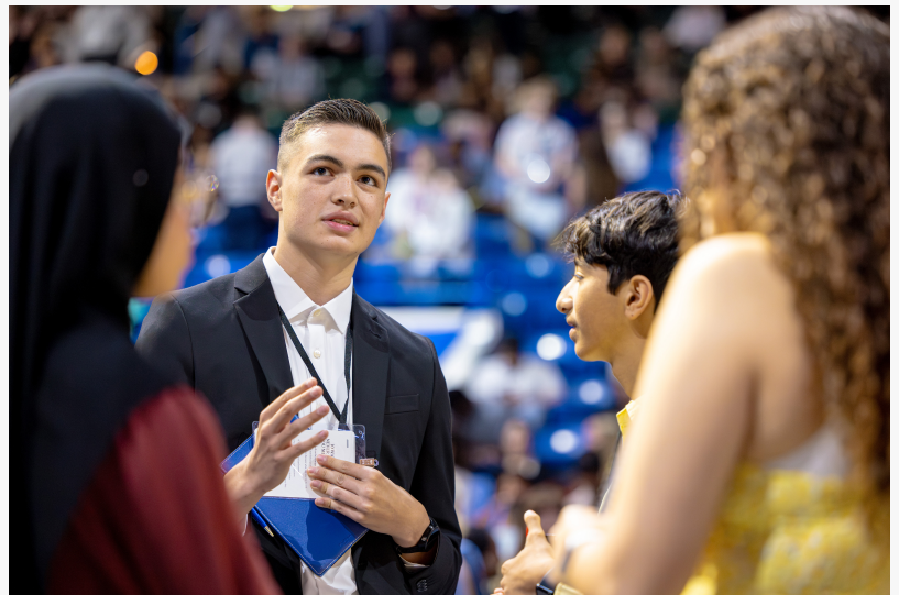
Nobel Laureates are Your Teachers at the Congress