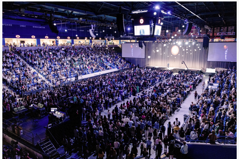
The Congress of Future Medical Leaders

Sponsored by the National Academy of Future Physicians and Medical Scientists, the Congress brings together more than 4,500 students annually, guided by some of the greatest minds in medicine — the men and women leading the medical miracles of the 21st century. For the 2.5-day Congress, student Delegates are mentored by recipients of the Nobel Prize, award-winning young inventors and scientists, leaders in medicine, medical futurists, and prominent medical school deans.