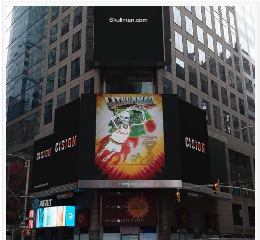
Lithuania Tie Dye® Slam Dunking Skeleton Jerseys 30th Anniversary celebrated in the center of the world Times Square, NYC for 30th Anniversary in 2022.

The real meaning of the image from the creator's own words: