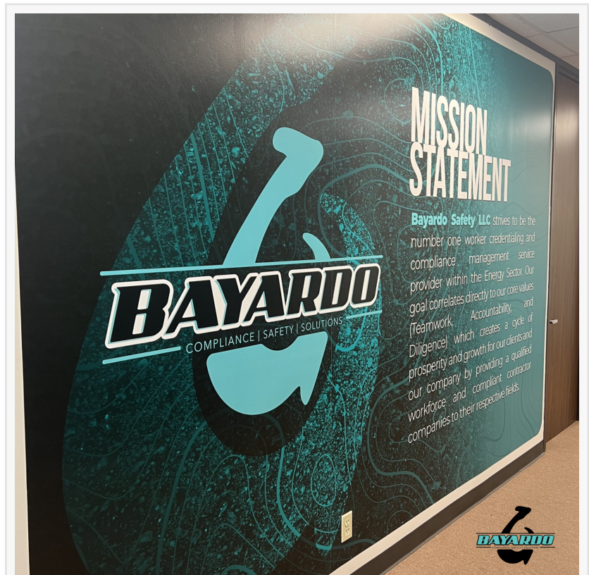
Bayardo Safety Mission Statement