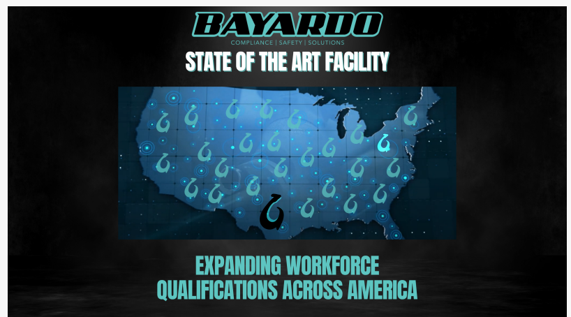
Bayardo Safety Announces State-of-the-Art Safety Training Facility in Texas, Expanding Workforce Qualification Services Across North America