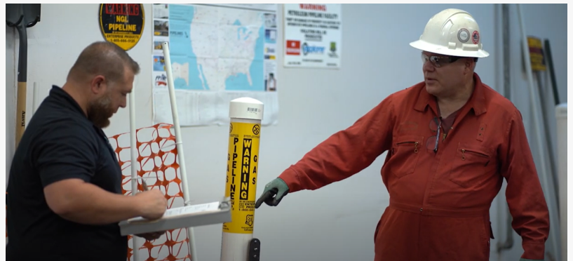
Operator Qualifications OQ Testing

This press release can be viewed online at: https://www.einpresswire.com/article/707590083