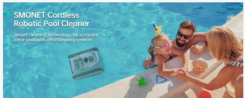
CR6 PRO Grey SMONET Cordless Robotic Pool Cleaner