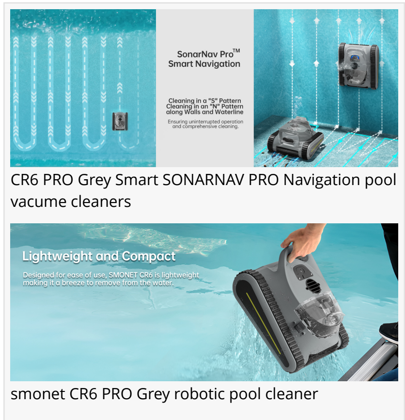
CR6 PRO Grey Smart SONARNAV PRO Navigation pool vacume cleaners

With a robotic pool cleaner, pool owners can recover the hours they'd otherwise spend