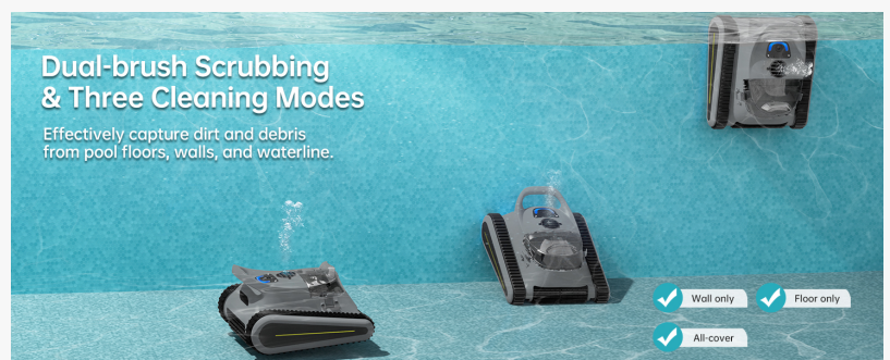
SMONET CR6 pro grey best remote pool cleaner