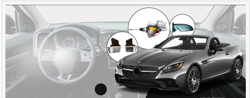
Buy Used OEM Car Spare Parts in USA At Affordable Rates

AUSTIN, TEXAS, USA, April 30, 2024 /EINPresswire.com/ -- Finding used original car spare parts to maintain car's performance and appearance was never been easier. 247 Car Spares is a leading online retailer in USA providing high-quality used OEM car parts and car care products. Car owners across the United States can conveniently order used OEM auto parts from the comfort of their homes via the company's website. With a diverse range of products available, customers can find everything they need to maintain their vehicles, from essential car components to detailing supplies, all in one place.