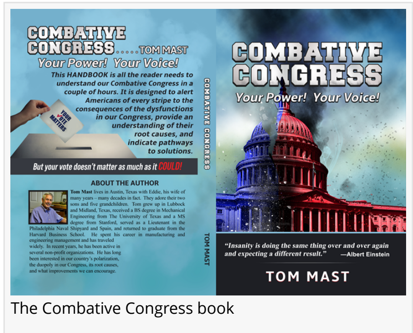
The Combative Congress book

into federal law in 1967 requiring every state to have single-member districts for the House of Representatives; this law has led to aggressive gerrymandering and thereby safe districts that