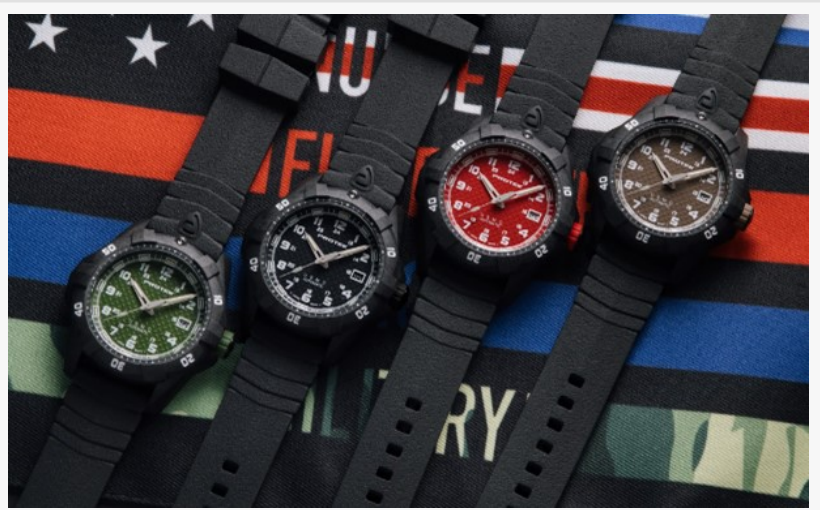
USMC Automatic Family Shot

BOISE, IDAHO, UNITED STATES, April 30, 2024 /EINPresswire.com/ -- ProTek Watch proudly announced that it is expanding its Official USMC Watch Collection with the addition of Seiko 24-Jewel automatic movements in its Carbon Composite Case dive watches , to be available in June. This is the same “workhorse” movement found in many of Seiko’s great dive watches.