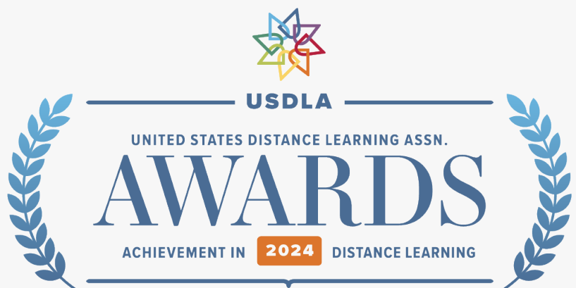
USDLA Awards logo