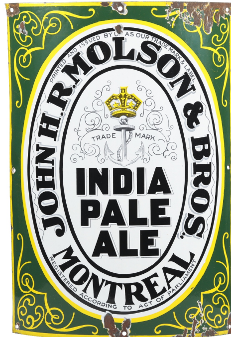
Early and exquisite John H.R. Molson and brothers single-sided porcelain Montreal India Pale Ale corner sign (Canadian, 20th century), 24 inches by 16 ½ inches (est. CA$9,000-$12,000).