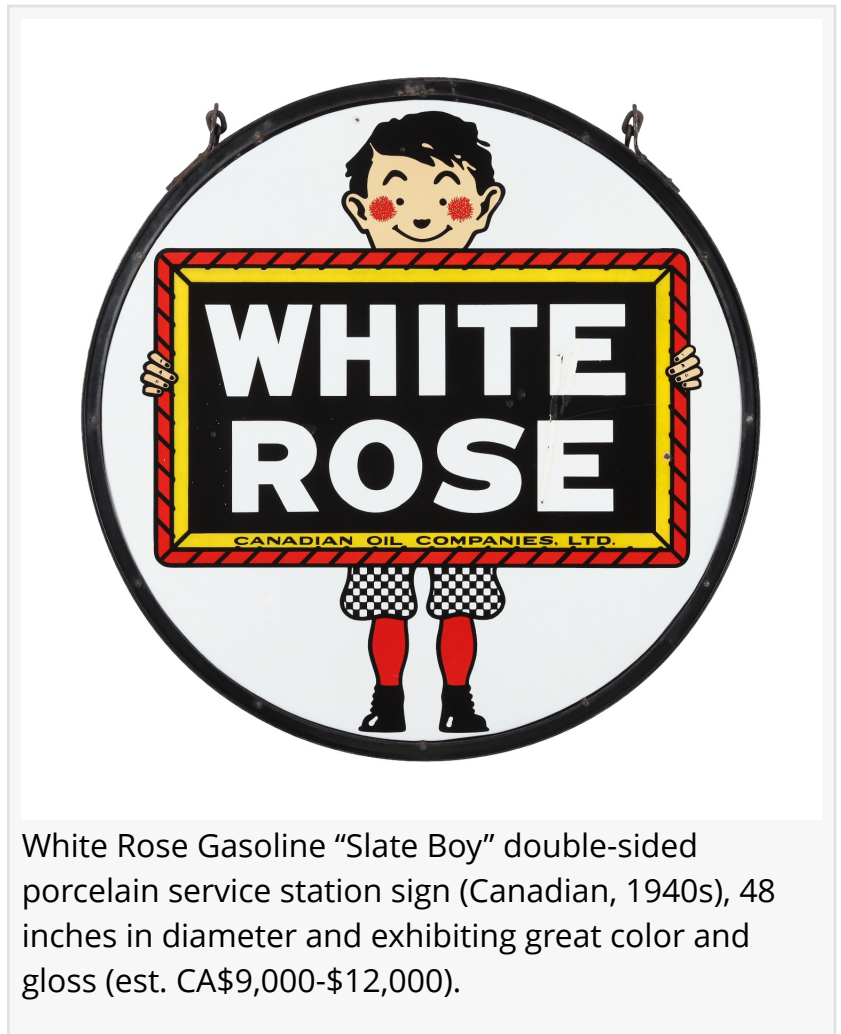
White Rose Gasoline "Slate Boy" double-sided porcelain service station sign (Canadian, 1940s), 48 inches in diameter and exhibiting great color and gloss (est. CA$9,000-$12,000).

While these are online-only auctions with no live gallery bidding, bidders can tune in to the live webcast on auction days, to watch lots close in real time. Here's a link to all three auctions: