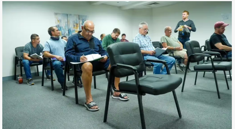
East Point Recovery Center Group Therapy Sessions