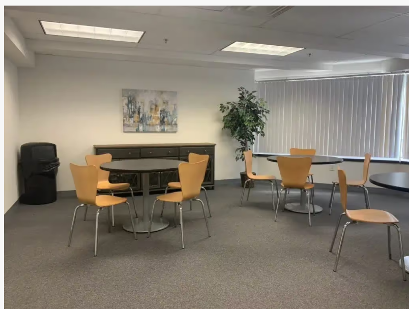
East Point Recovery Center Common Area

This press release can be viewed online at: https://www.einpresswire.com/article/707826394