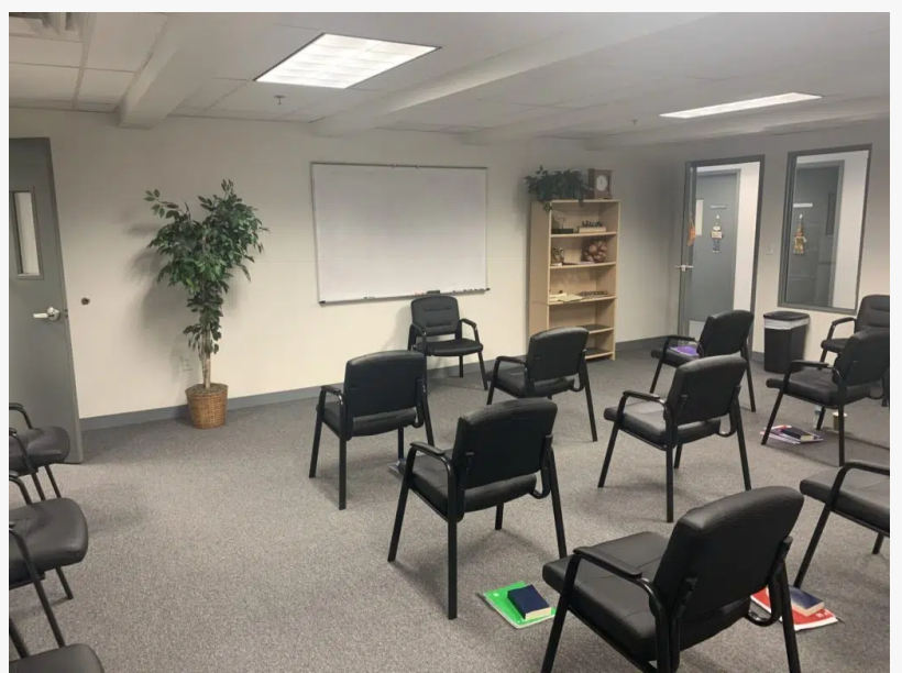
East Point Recovery Center Therapy Facility