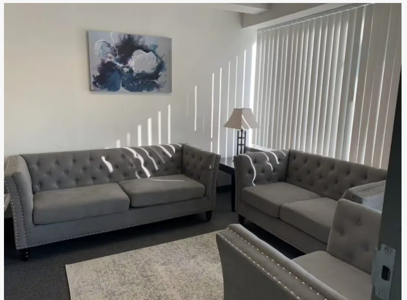
East Point Recovery Center Therapy Room