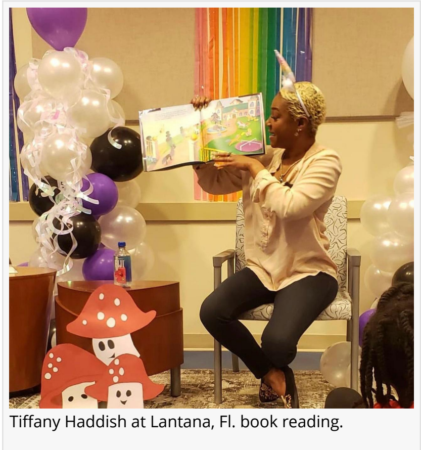
Tiffany Haddish at Lantana, FL. book reading.