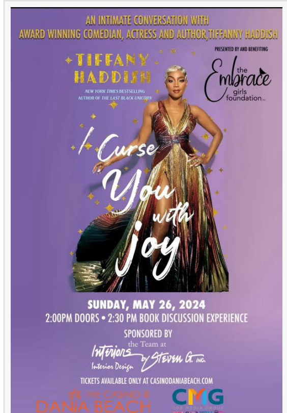
Tiffany Haddish Tea Talk benefit poster.