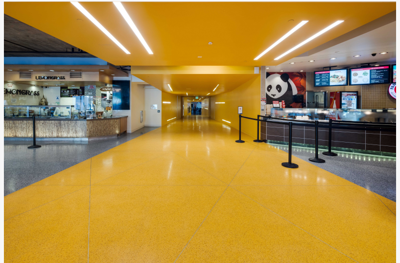
TERRAZZO flooring was used to create a yellow tunnel at the renovated Price Center.

/EINPresswire.com/ -- One of the largest student centers in the country, Price Center is the central hub for campus dining and services for the University of California's San Diego campus. Over 30,000 daily visitors visit the student center, which underwent a significant interior and exterior renovation in 2023, including the installation of an award-winning new terrazzo floor.