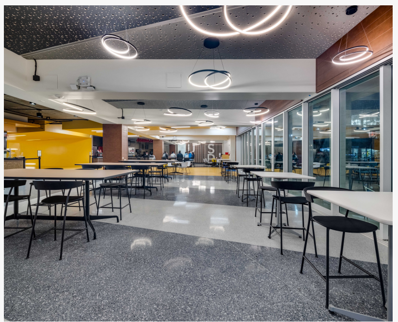
PRICE CENTER'S modern design is complemented by the award-winning terrazzo floor.

The NTMA's annual Honor Award program recognizes outstanding terrazzo projects its members submit. The program promotes member contractors as the sole qualified resource for terrazzo installations that meet industry standards. Terrazzo veterans and design professionals evaluate the entries.