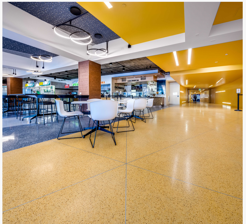
HANDCRAFTED terrazzo was poured in place in the renovated Price Center.