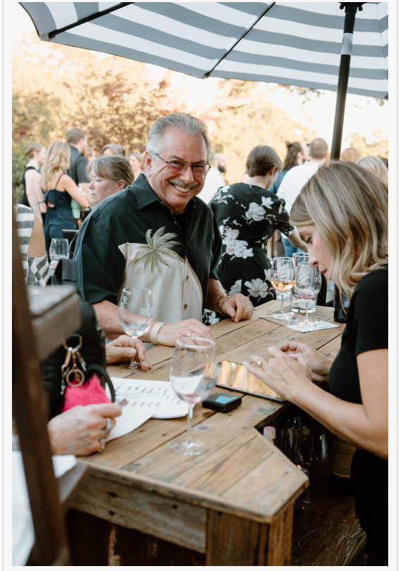
Rancho Roble's signature wine (included with ticket purchase)

The Classic Theatre, 501C3, established in 2021, is a professional theatre company dedicated to the betterment of Placer County by employing artists and