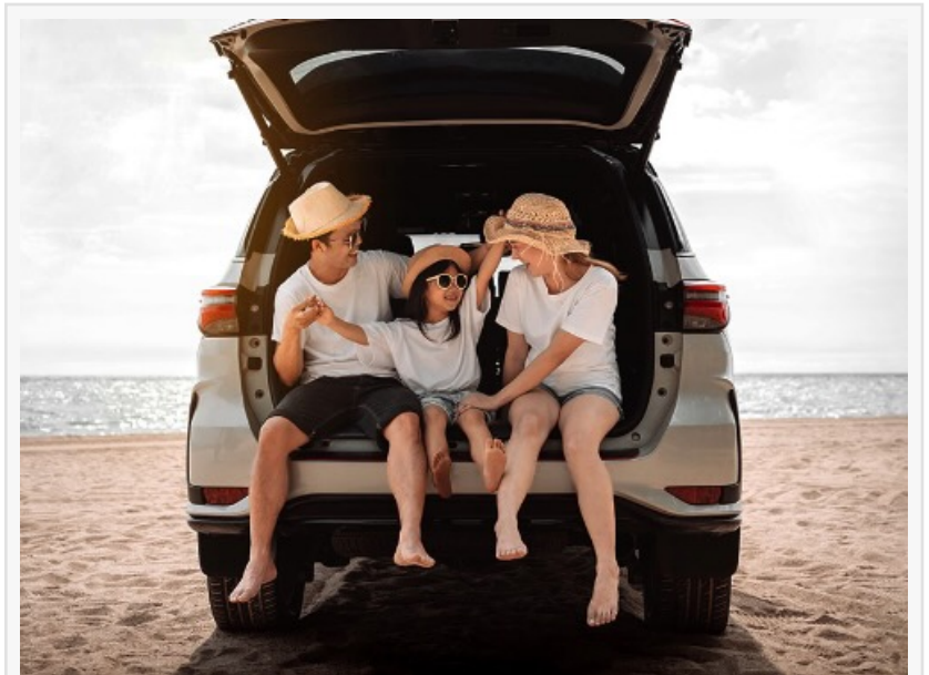
Family in rental car