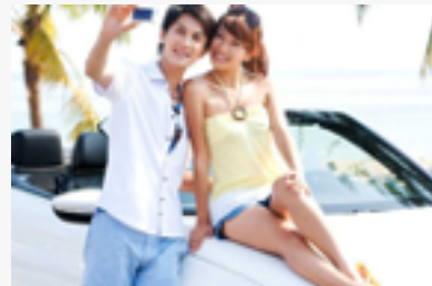
Happy Visitors in Rental Car