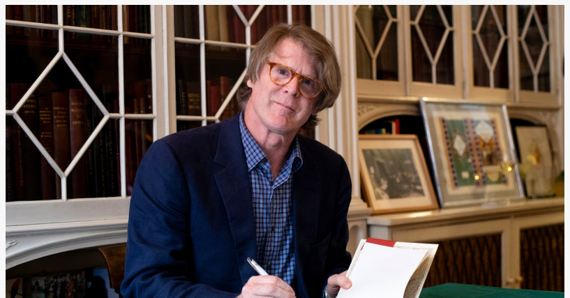
Mark Getty

2024. The degree will be conferred at their annual commencement ceremony on May 16th, 2024, at Villa Aurelia in Rome. Mr. Getty, co-founder and chairman of Getty Images, has been nominated in recognition of his substantial contributions to the visual arts and his commitment to cultural heritage.