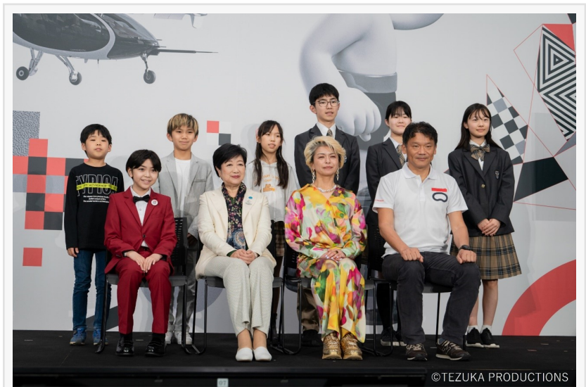
SusHi Tech Tokyo 2024 P3

The Showcase Program immerses visitors in what the TMG describes as a “full sensory experience of the Tokyo of 2050” at four venues in the bay area.