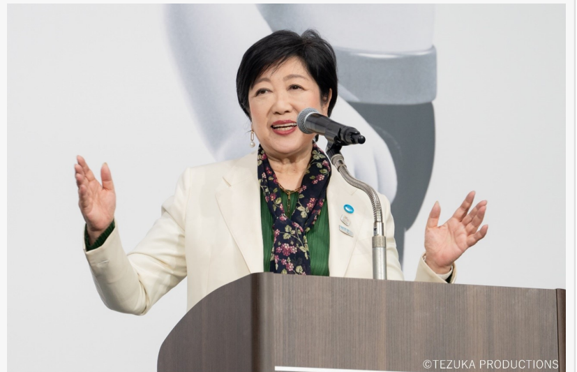
SusHi Tech Tokyo 2024 P2