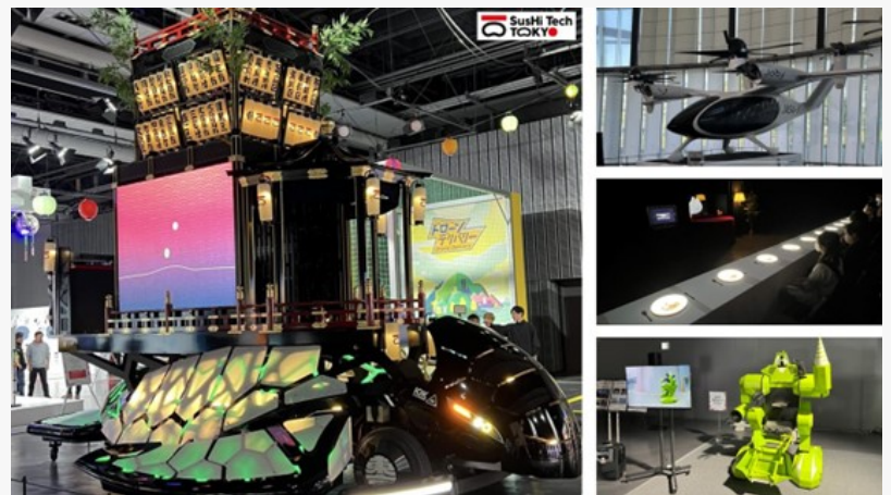
SusHi Tech Tokyo 2024 P4