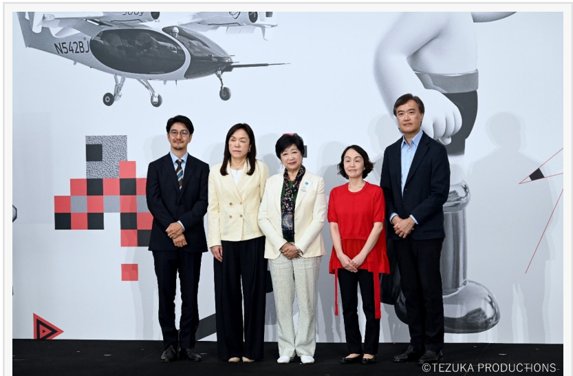
SusHi Tech Tokyo 2024 main

The TMG has been promoting “Sustainable High City Tech Tokyo, or “SusHi Tech Tokyo” for short,