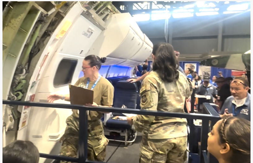
Competitors from schools, the airlines and the military tackled aviation maintenance challenges.