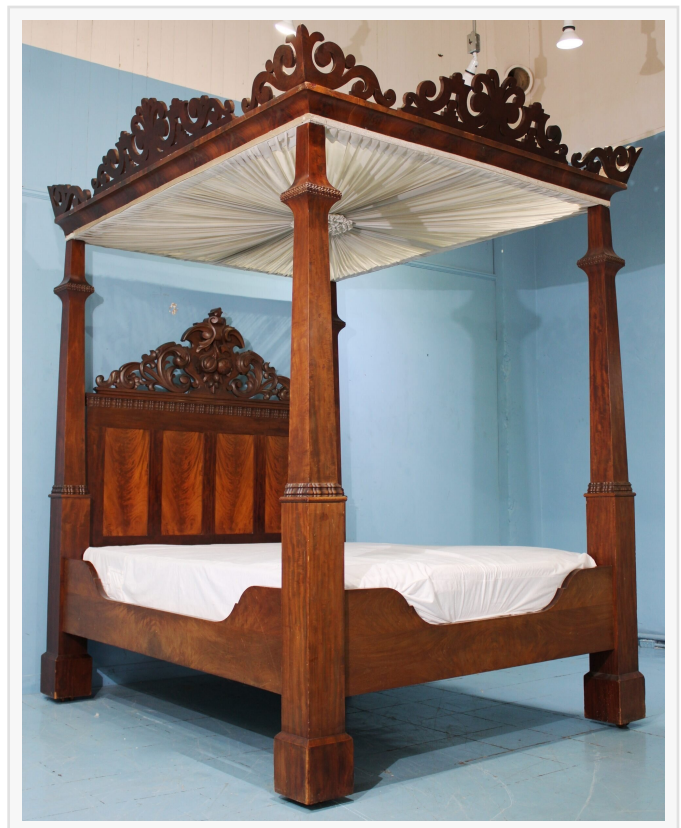
Mahogany plantation full tester bed with a carved headboard and pierce carved gallery around the top, 103 inches tall by 71 ½ inches long by 63 inches wide (est. $4,000-$8,000).

New pictures are continually being added to the Stevens website (<u>www.stevensauction.com</u>), so interested parties are encouraged to check back often for new additions and further information.