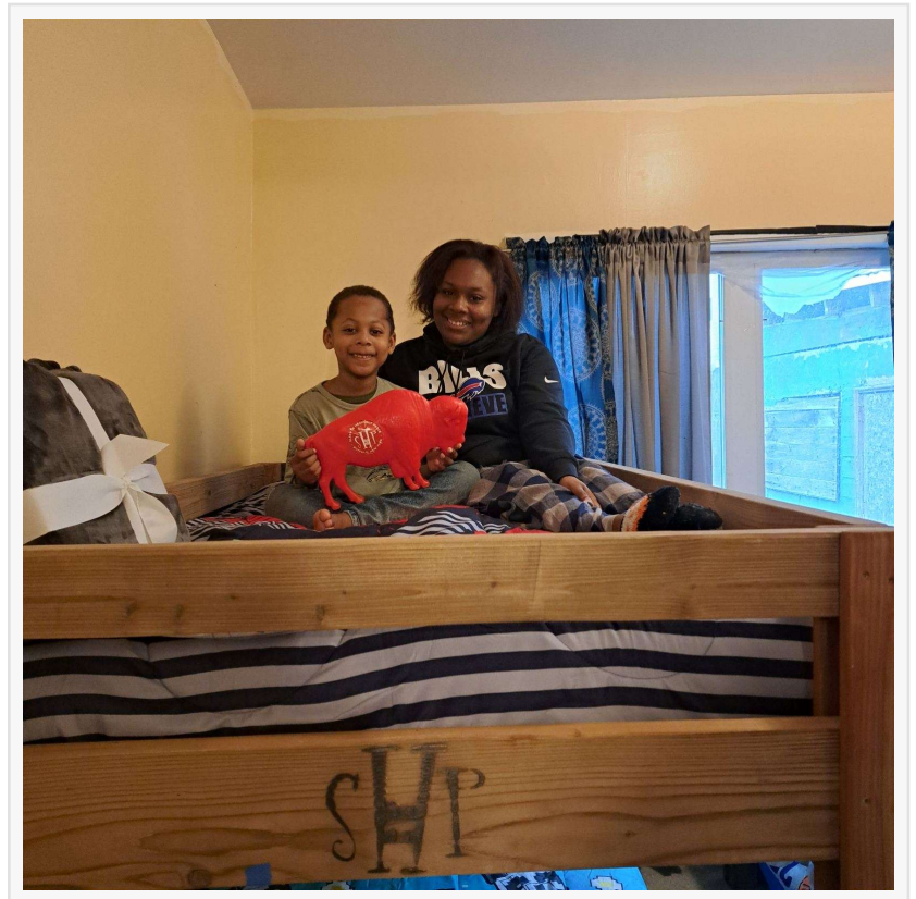
Family members snuggle together on the top bunk of the 200,000th delivered bed from Sleep in Heavenly Peace.

Sleep in Heavenly Peace (SHP) is a 501(c)(3) non-profit dedicated to building and delivering beds to children in need. Fueled by volunteers' kindness and donor generosity, we're growing our impact across the U.S. and beyond. We believe a bed is a basic need for a child's well-being, and our mission is simple: NO KID SLEEPS ON THE FLOOR IN OUR TOWN! Learn more and get involved at shpbeds.org.