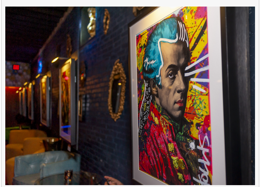
BAD REPUTATION art by HOLLIS - VIP Exhibit - The Eighth Room | photo credit: Allie Godwin

This press release can be viewed online at: https://www.einpresswire.com/article/708088341 EIN Presswire's priority is source transparency. We do not allow opaque clients, and our editors try to be careful about weeding out false and misleading content. As a user, if you see something we have missed, please do bring it to our attention. Your help is welcome. EIN Presswire,