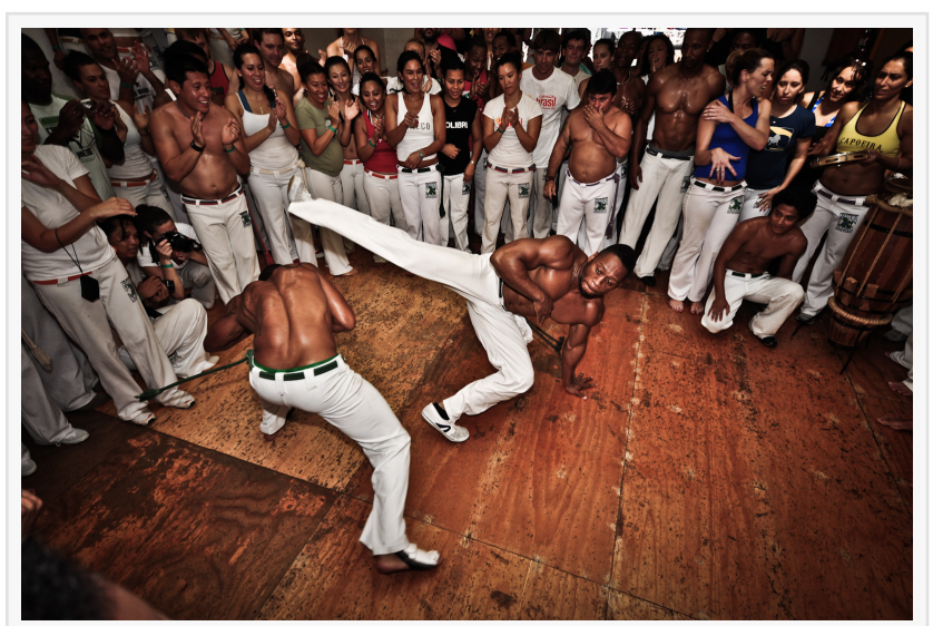
Ponto de Cultura is happening on July 16th to 21st, 2024