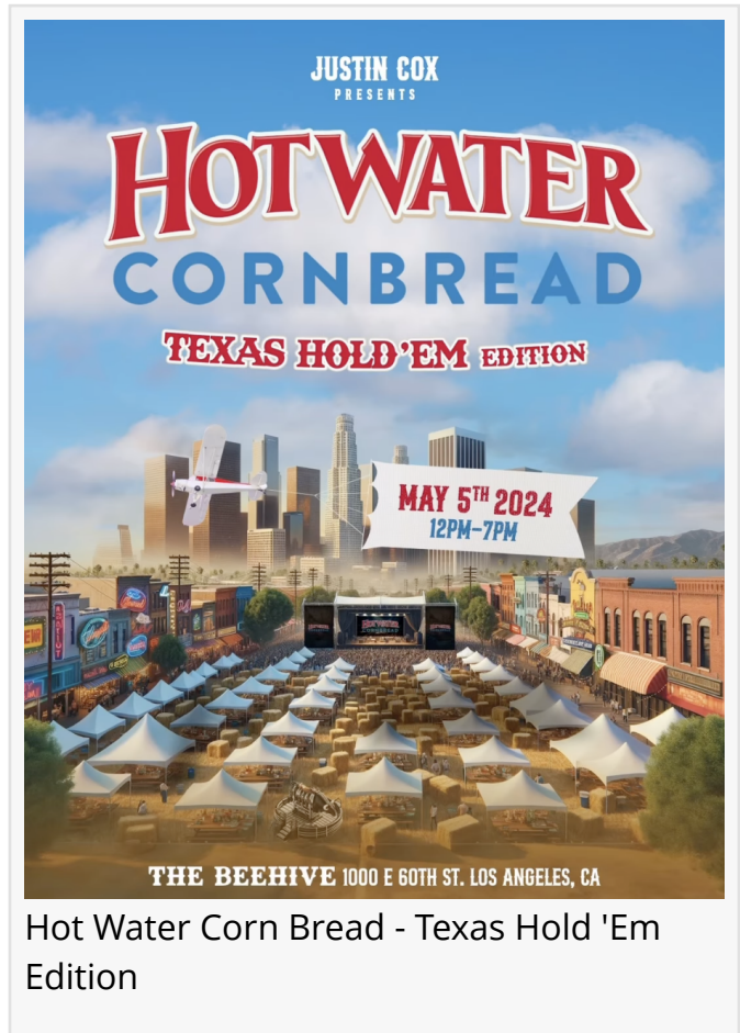
Hot Water Corn Bread - Texas Hold 'Em Edition

“The goal of Hotwater Cornbread is to celebrate the fun and diverse Southern food and music culture, while providing a platform for Black businesses to generate revenue and thrive,” Justin