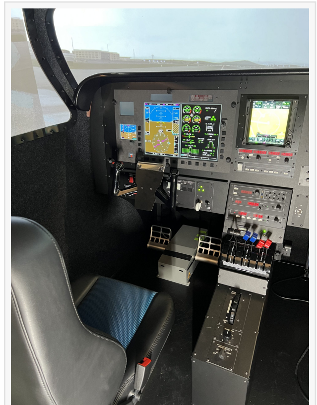
ELITE S311 Convertible FNPT II

This press release can be viewed online at: https://www.einpresswire.com/article/708255746