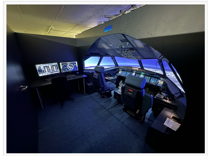
ELITE A320 FAA Device

Training facilities and aviation enthusiasts looking to learn more about ELITE and its range of advanced flight simulators are invited to meet the team this week at the AERO Friedrichshafen show. The ELITE team is in attendance throughout the event and can be found in Hall A5, Booth 215.