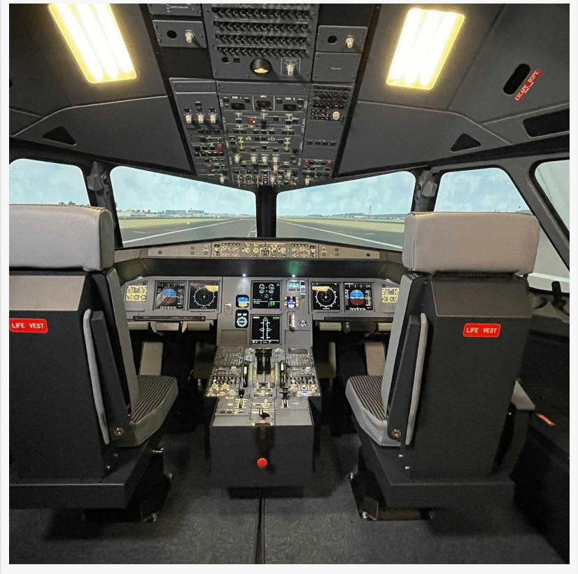
ELITE A322 FNPT II MCC

training services provider, with the highly experienced instructors enjoying over three decades of flight experience across Chile, the USA, Peru, and Argentina. As one of the most respected institutions in the country, the school has helped train countless commercial and private pilots through its wide range of courses.