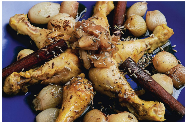
Tangine - A Moroccan Dish