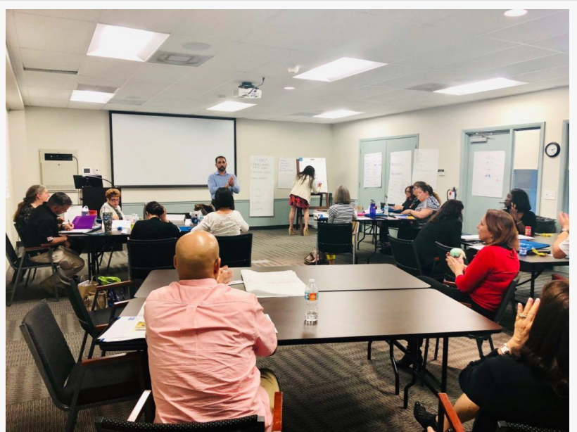
MHFA Training Class