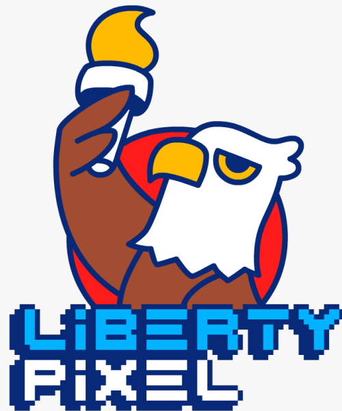
Liberty Pixel Logo