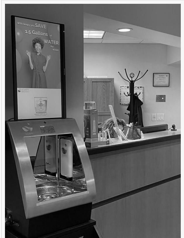
SoapyPro Mobile - Nursing Station

This press release can be viewed online at: https://www.einpresswire.com/article/708369649