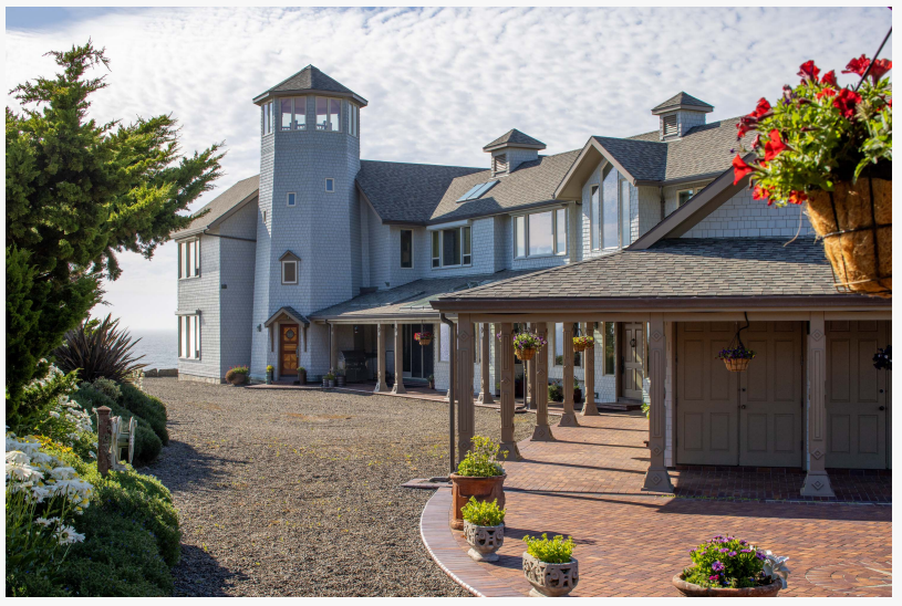
'Nestucca Sea Ranch', 41900 Horizon View Avenue, Central Coast, Cloverdale, Oregon

that frame breathtaking vistas of windswept grasslands, tidal currents, Haystack Rock, and neighboring headlands. Ascending the grand staircase crafted from exquisite Mahogany and