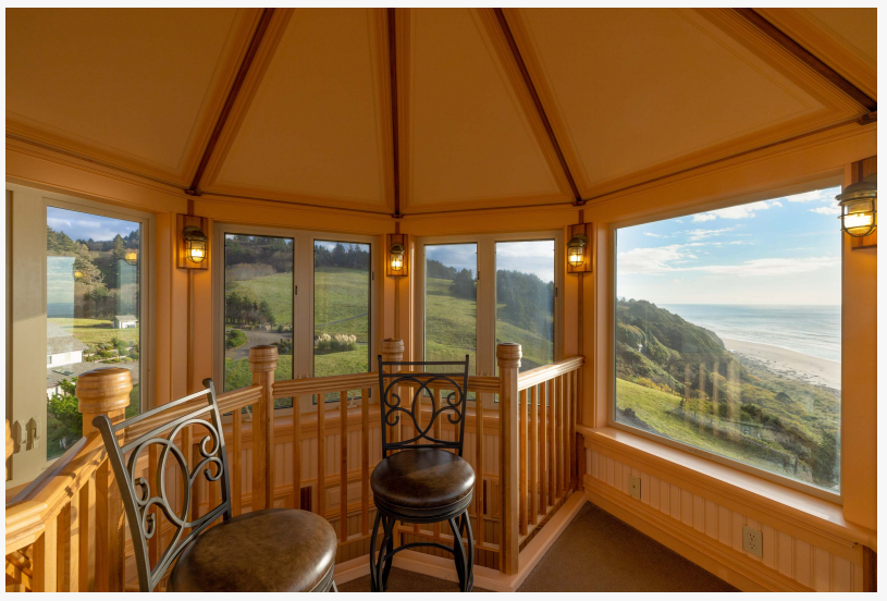
'Nestucca Sea Ranch', 41900 Horizon View Avenue, Central Coast, Cloverdale, Oregon

of business development at Sotheby's Concierge Auctions. "Rarely does such a unique coastal gem like this one become available for purchase. We are thrilled by the enthusiastic response from our extensive network of prospective buyers as we approach our two-week open bidding period, in partnership with Cascade Hasson Sotheby's International Realty."