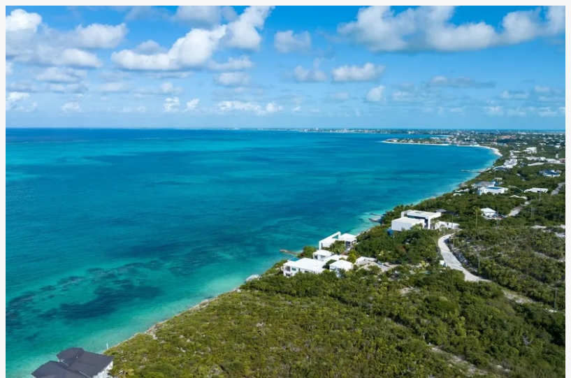
Oceanfront Building Parcel, Lot 40

Adjacent to Lot 40, Lot 11 starts at $500,000, with bids expected to top out at $2.7 million. It features striking panoramic views from its 'penthouse' location at The Summit, an exclusive community of private estates. The property includes preliminary architectural plans, offering a vision for a grand estate that could include multiple residences and custom amenities.