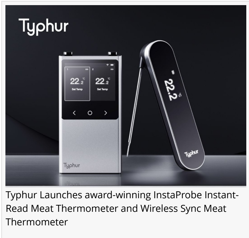
Typhur Launches award-winning InstaProbe Instant-Read Meat Thermometer and Wireless Sync Meat Thermometer

Having already collaborated with renowned culinary enthusiasts, chefs, and influencers, including UK native Brooklyn Peltz Beckham, this