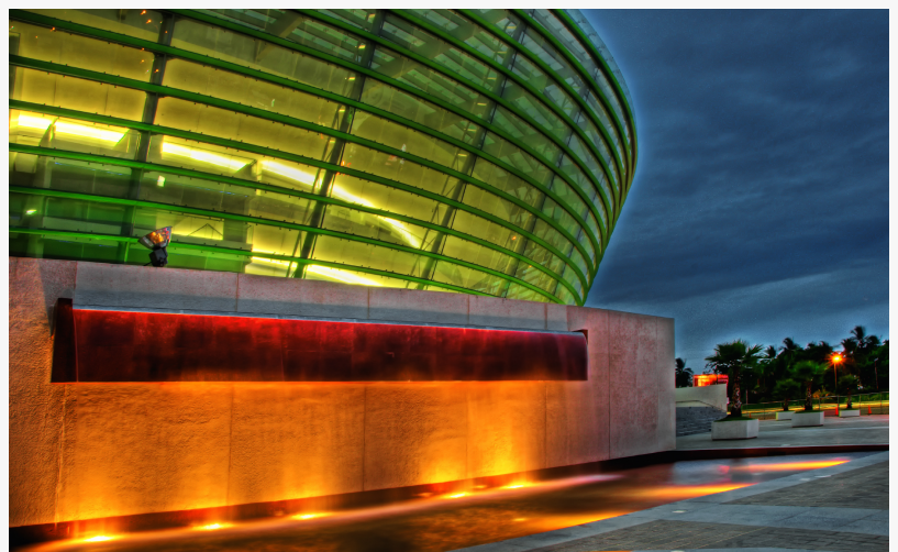
Hotels are Open and Ready to Welcome Travelers

SPRING, TEXAS, TX, UNITED STATES, May 3, 2024 /EINPresswire.com/ -- The pearl of the Pacific continues to be reactivated every day, proof of this are all the companies, organizations and businesses that trust in this new stage of Acapulco, which is committed to providing more and better services for all visitors. .