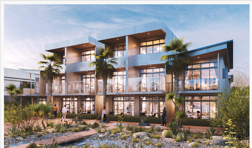
An 88-unit luxury condo development in the Southern California Coachella Valley by TLC Modular USA

In addition, TLC Modular USA is designing and bidding on over 1 million square feet of hotels, apartments, and assisted living facilities for clients by converting their existing stick-built plans