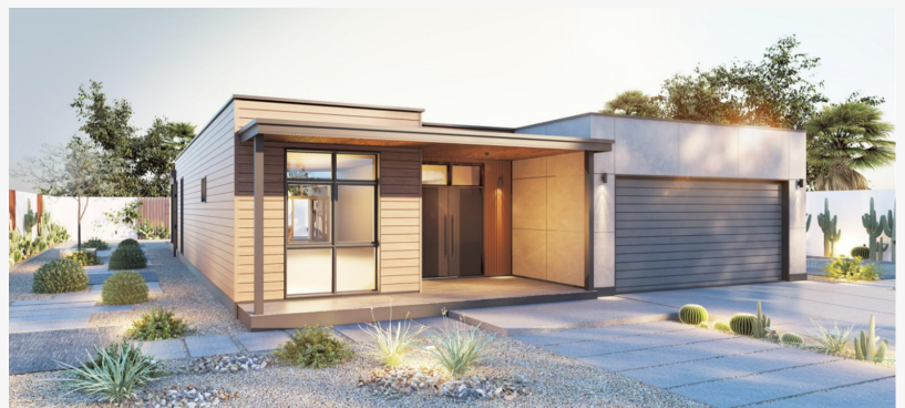
Luxury 4 Bedroom Home "California Dreaming" by TLC Modular USA