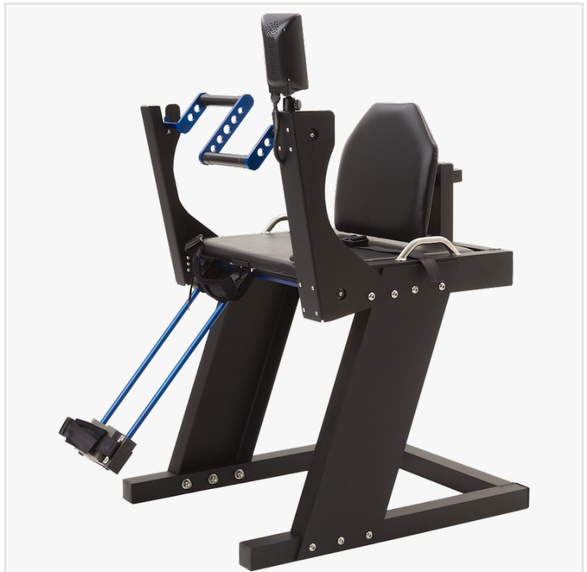
GenuEase Knee Recovery Rehab Device

KneeEASE and GenuEase™ have been making waves in the physical therapy world for over a decade with their cutting-edge technology and proven results. These devices are specifically designed to aid in the recovery of patients with frozen-knee conditions, providing a safe and effective