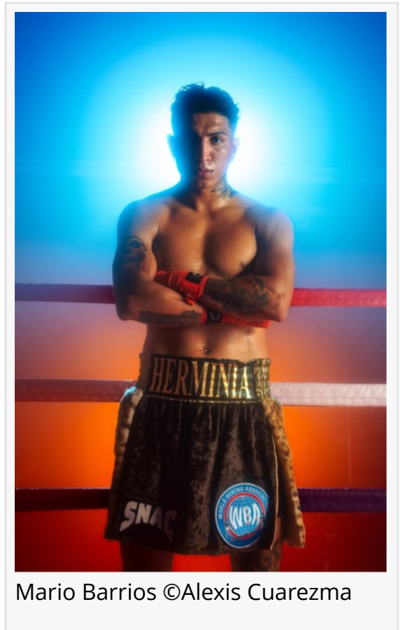
Mario Barrios