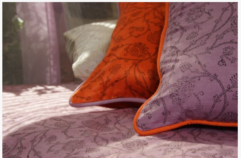
Home Accessories Customized.

The printed fabric can also be used for wall hangings or a great cover for the couch. If printed on Leather or suede it would represent expensive taste along with aristocratic elements. The collage has been created by hand by using Fashion Magazines and cut outs from the magazine and then added to fill the negative and positive spaces on a 11x14 size paper. (can be framed as well)