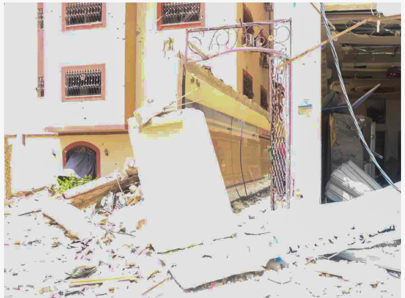
The remnants of a home in Gaza, standing defiantly in the face of conflict.

This press release can be viewed online at: https://www.einpresswire.com/article/709038541