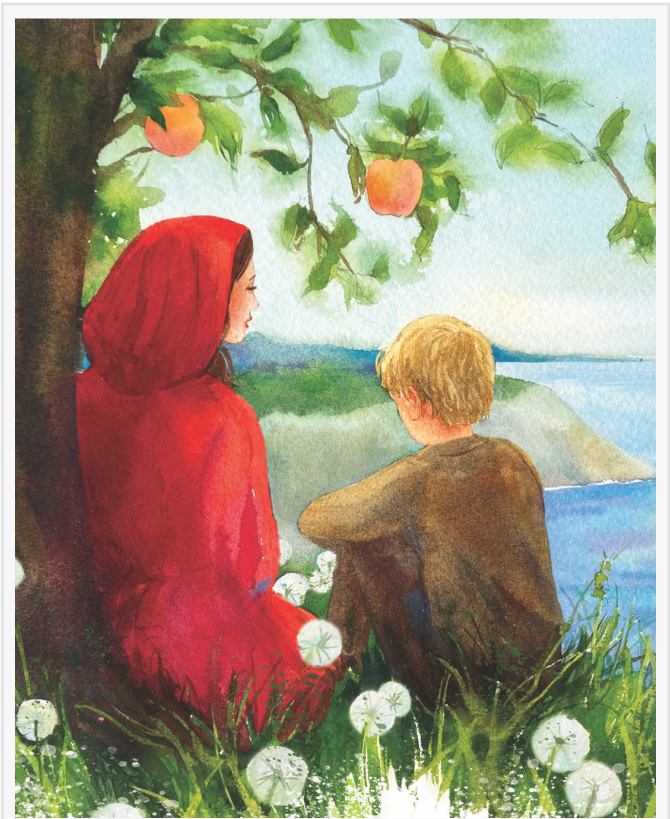
Sage & Boy

Wonder Shell invites readers to embark upon a transformative journey alongside Corazinda, to unravel a mystery and unlock the true power of kindness. This tale encourages reflection on our own burdens and those we witness in others,