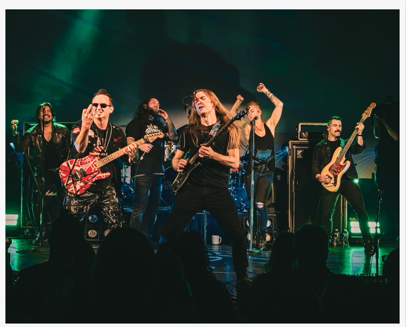
A.D.A.M. Music Project live at Tower Theater in Oklahoma City, OK