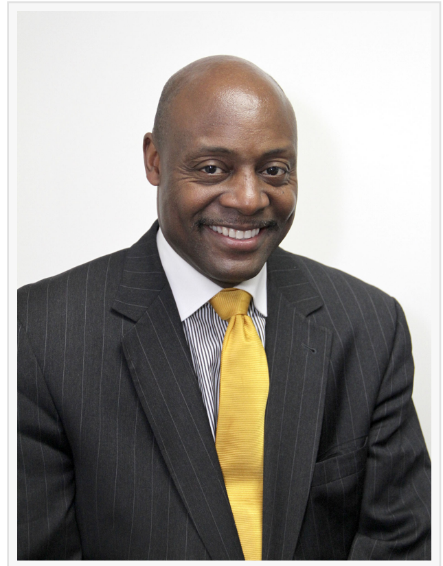
President of the National Black Church Initiative

Produced by National Black Theatre and The Apollo, The Gathering: A Collective Sonic Ring Shout, is more than just a show; it redefines its purpose for a