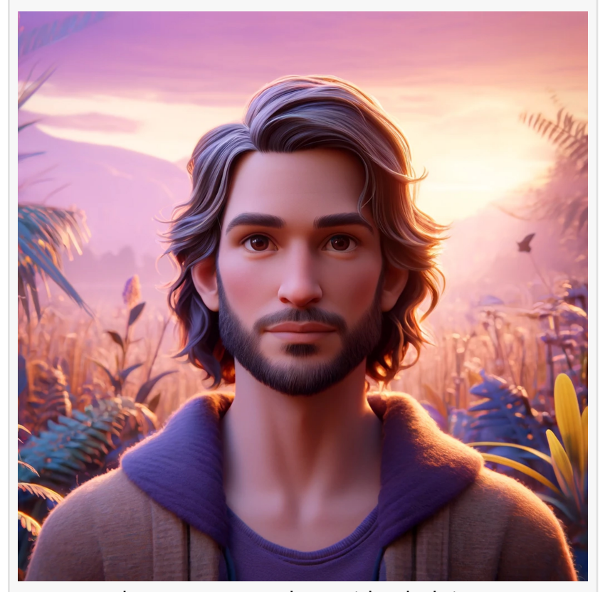
Meet Noah, your personal Al guide - helping you build and maintain your Ark.

- AR/VR Integration: Through engaging AR/VR technology, players can interact directly with the animals and environments they are working to protect, offering an unmatched immersive experience.