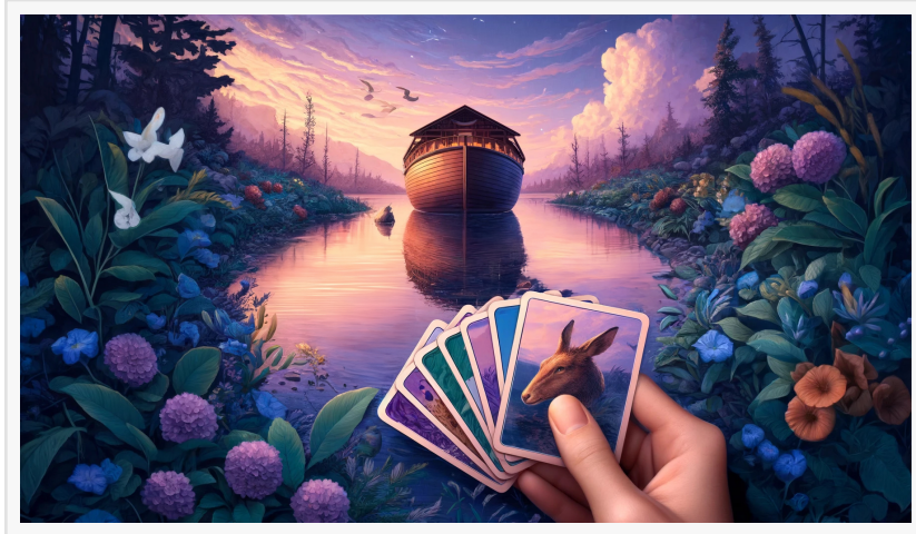
Collect ArkChainGo's Cards and fill your ark with endangered species.

- Strategic Gameplay: Inspired by classics like Magic: The Gathering, players must strategically manage resources similar to deck-building to successfully build their ark and save animal species.