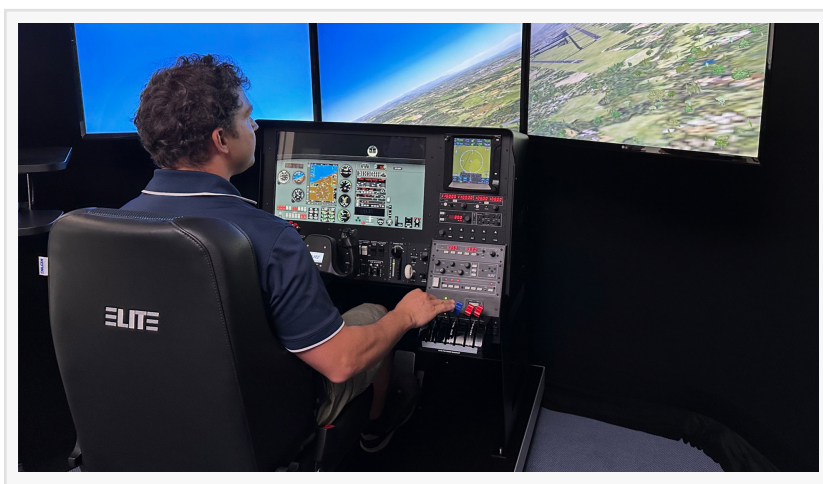
PI135 Pro MEP BATD

ZüRICH, SWITZERLAND, May 6, 2024 /EINPresswire.com/ -- ELITE Simulation Solutions is excited to announce that it will be supplying one of its advanced PI-135 BATD simulators to the Aeronautical School of the West Indies (ASWI). Working with trainee pilots across the Caribbean, the addition of