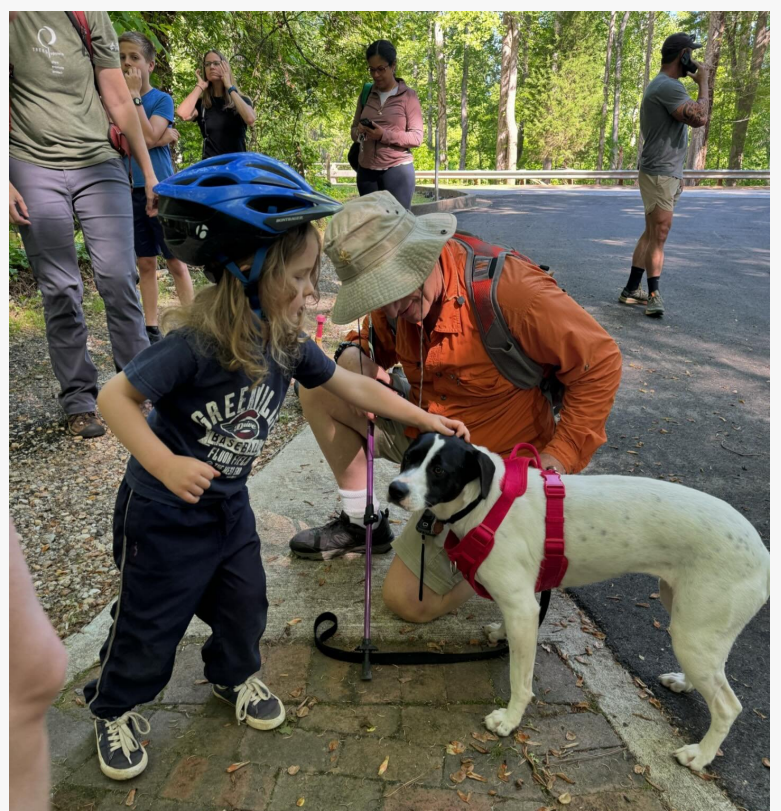
SC7 2024 participants on the trail.

Also visit https://www.southcarolina7.com/conference for additional information and sponsorship opportunities for the SC7 2024 Resiliency Conference.