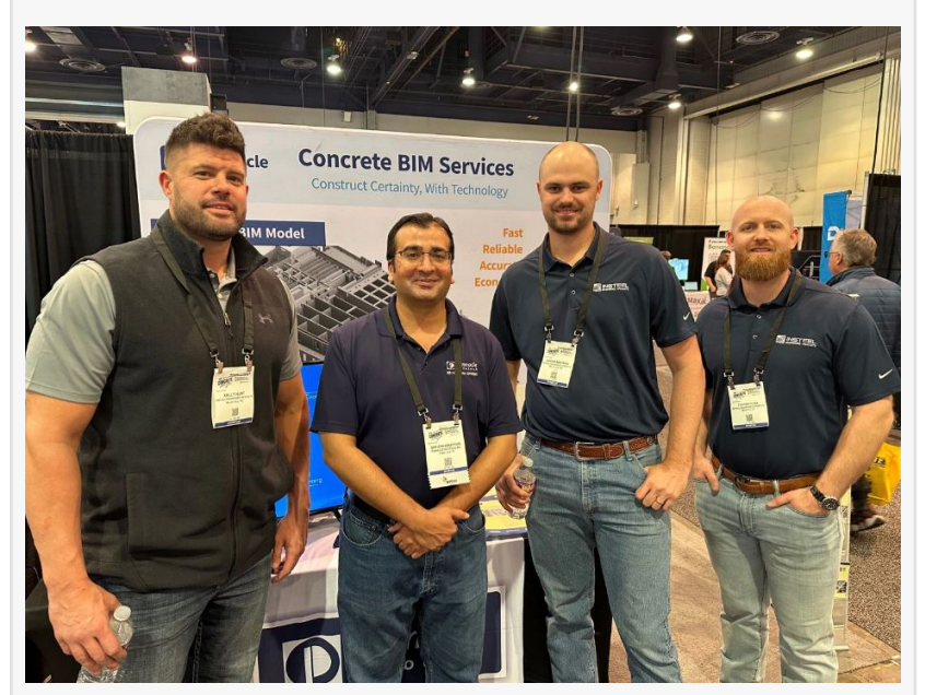
From Last Year

Pinnacle Infotech - Constructing Certainty with BIM Technology