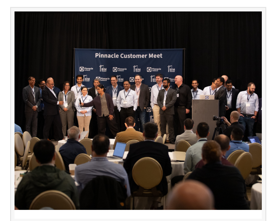
Pinnacle's 5th Global BIM Summit

Pinnacle Infotech is a global leader in Building Information Modeling (BIM) and digital construction solutions. With a remarkable track record spanning over 30 years, Pinnacle Infotech has