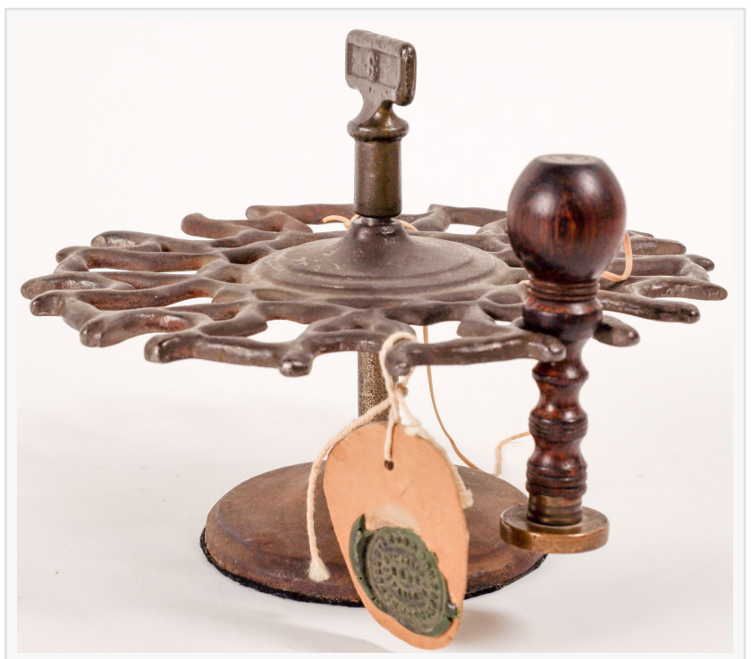
Wells Fargo & Co. Express wax seal hand stamp from 1885, brass with a wood handle, 4 inches long, accompanied by an antique wrought iron carouselstyle stamp holder (est. $400-$1,000).

The two-day auction will be hosted exclusively on iCollector.com, Holabird's preferred online bidding