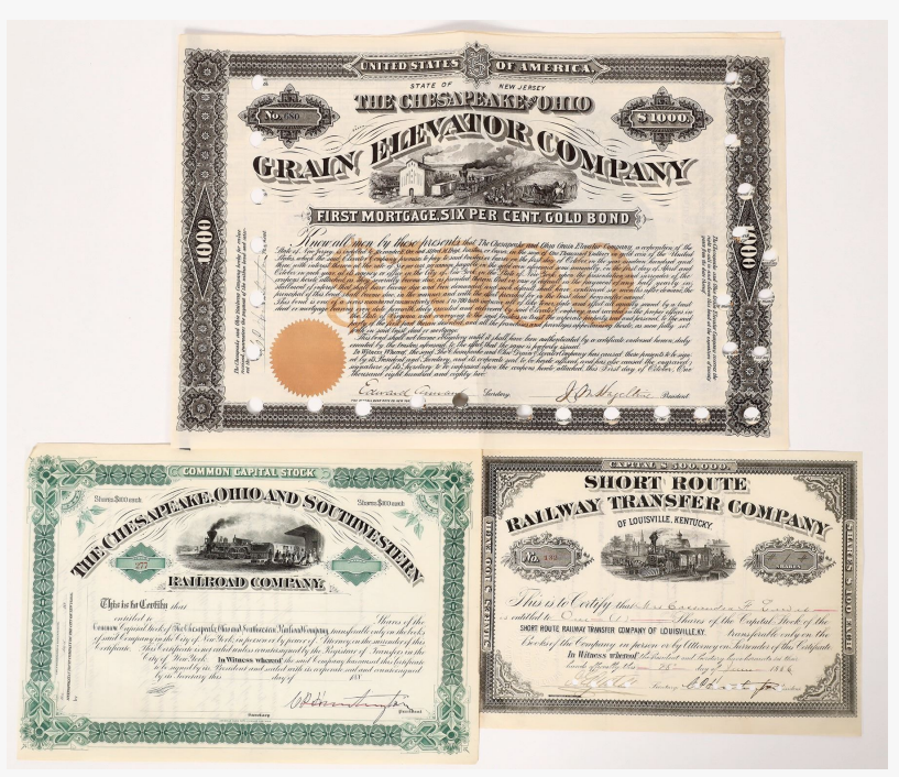
One lot of three different 1880s railroad stocks, all with the signature of Collis P. Huntington, one of the "Big Four" founders of the Central Pacific Railroad (est. $250-$500).

Bottles will be led by a purple embossed Goldfield Bottling Company bottle. G.B.C. operated from 1904-1915, selling to saloons, stores and the public. The bottle should bring $400-$600.