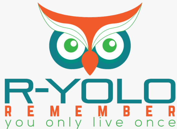
R-YOLO Company Logo