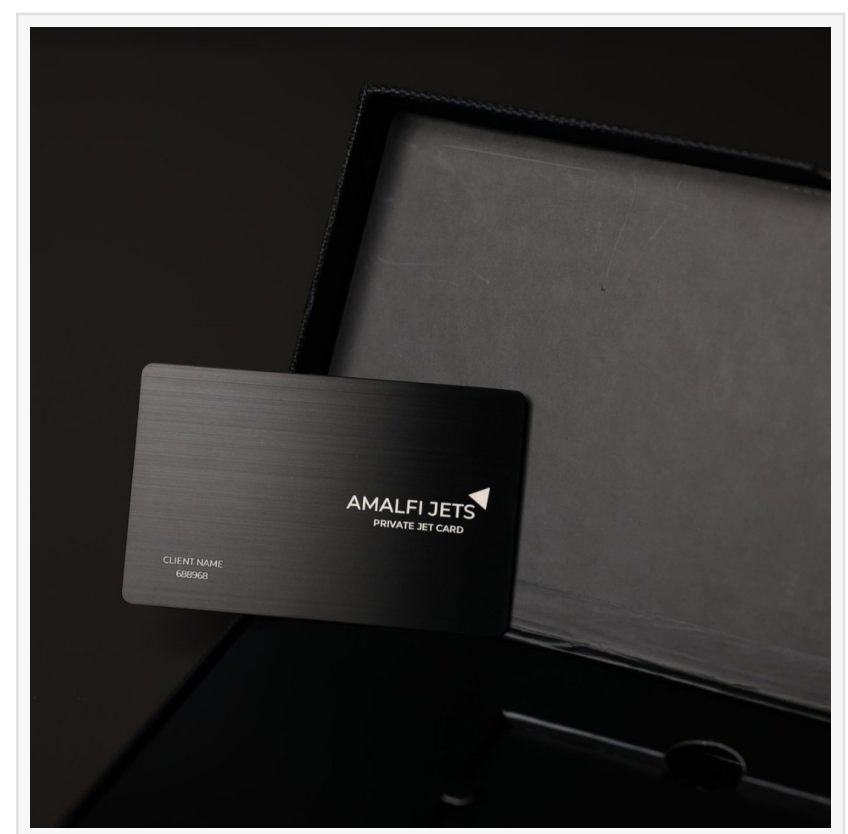
Amalfi One Jet Card

Amalfi Jets is honored to provide exceptional customer service, with their in-house Concierge Team that is available 24/7 for their cardholders and the additional personnel on their team will strengthen this offering. The full Amalfi Experience includes complimentary Black Car Service, premium cuisine and alcohol, and an in-person representative at every departure airport. Amalfi Jets ensures the safety and comfort of its passengers by maintaining the highest cleanliness standards and requiring newly refurbished, stain-free, and damage-free aircraft in their network.